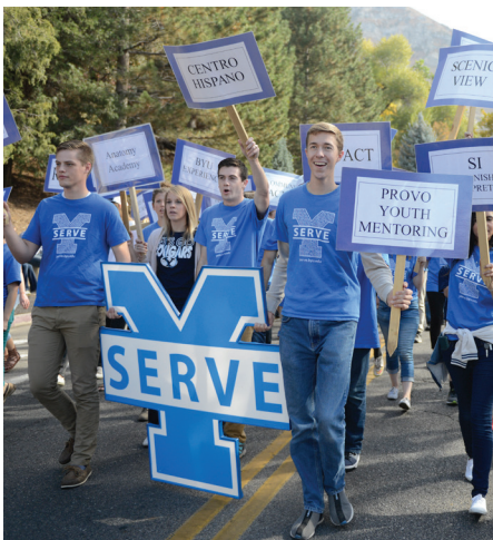
Service Council is actively involved in helping run the various programs at Y-Serve.

meaningful service out of love for God and for our neighbors. Thank you for being a part of those experiences; and let us all continue to make a conscious effort to choose to serve God and our neighbors in all of our words and actions.