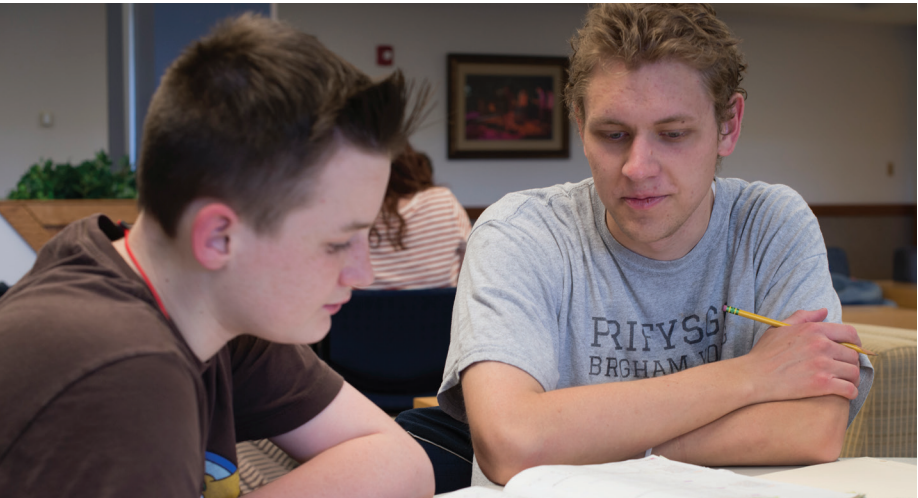
Top: Volunteers with Freshman Service Corps get a taste of all different kinds of service with their monthly activities. Left middle: Students get a variety of opportunities to serve with Red Cross Services , including training, donating blood, and safety education. Right middle: Community Clean Up provides volunteers the opportunity to give back to their community by helping beautify local lands. Bottom: Free tutoring is available for K-12 students with the Seeds of Success program, giving volunteers the opportunity to tutor in a subject that they excel in.