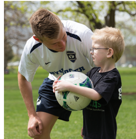
Paint a Wish gives volunteers the opportunity to interact with and teach children with different medical conditions.

Through their involvement with Y-Serve, the students learn valuable leadership lessons. They work together to organize, prepare, direct, and evaluate activities that benefit the community. In 1 Corinthians 12 we read that “diversities of gifts” are “given to every man to profit withal” (verses 4 and 7). Not only do they bring their talents to the group, many also discover that they have additional gifts as they fulfill new types of responsibilities. As Elder Neal A. Maxwell stated, “God does not begin by asking us about our ability, but only about our availability, and if we then prove our dependability, he will increase our capability!” (“It’s Service, Not Status, That Counts”, Ensign, July 1975). The students come from