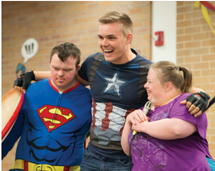
Left: Student volunteers in Cougar Coaches volunteer their time and knowledge of sports to coach youth athletic teams. Right: At BYU Experience , individuals with cognitive disabilities come to BYU once a semester and enjoy a night full of fun with students.

Tutoring, as well as hope and peace to members of the Utah Valley community and beyond through dozens of other service programs. Y-Serve has 70 service programs, each run by volunteer student leaders who give freely of their time and talents. Our Center’s programs provide a wide variety of service opportunities to the student body. Students are able to supplement their education with authentic, hands-on learning experiences in the service of others in fields such as education and mentoring, working with the disabled or elderly, event planning, and so on. Leadership opportunities are also fostered as student volunteers receive further training and apply to become Program Directors, Executive Directors, or serve on the Service Council.